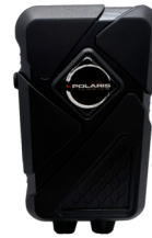
AHD to CVBS module