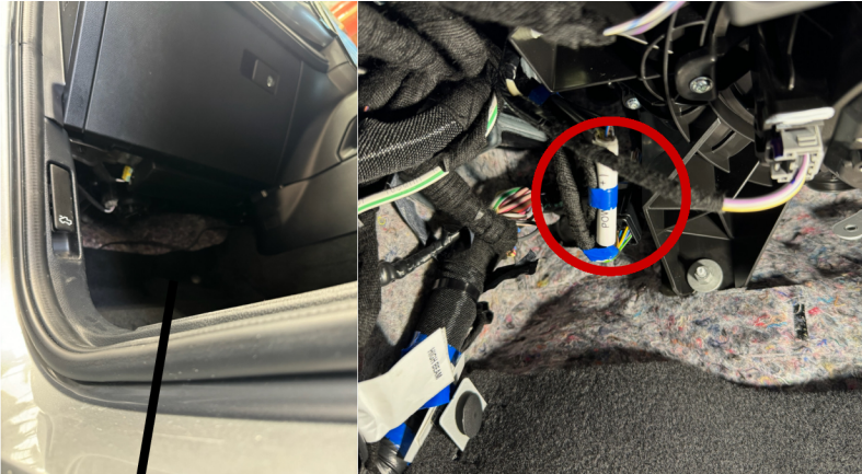
Camera wires are located underneath glove box