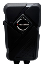
AHD to CVBS module